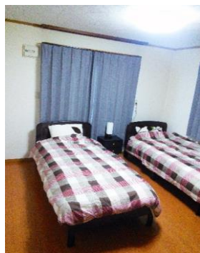
Kita Nishi Corp B201